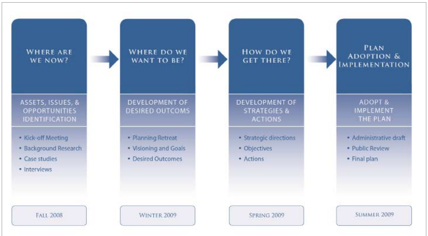
Figure 1: Planning Process