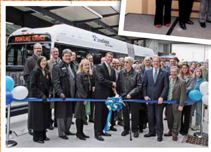
The Town Center Plan has resulted in significant transit investments in our community. Sound Transit opened the Mountlake Terrace Freeway Station in March of 2011.