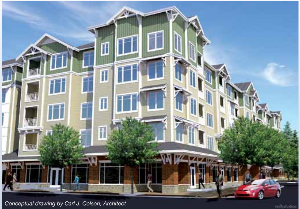
Conceptual drawing by Carl J. Colson, Architect

First steps in construction include tearing down the vacant concrete block houses and preparing the site for development. Arbor Village is expected to be completed next year.