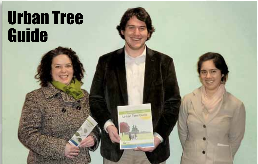
Three of the five UW students who collaborated with the city to develop an "Urban Tree Guide" in the urban planning program.

Five University of Washington (UW) students from the Community, Environment and Planning Department presented their Tree Planting and Presentation project to the City Council at their January 12 work/study session. The project supports and implements the city's Tree Preservation and Protection efforts as identified in the Sustainability Strategy and the Comprehensive Plan.