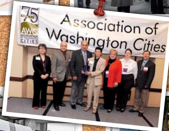
2009 Governor's "Smart Vision Award".