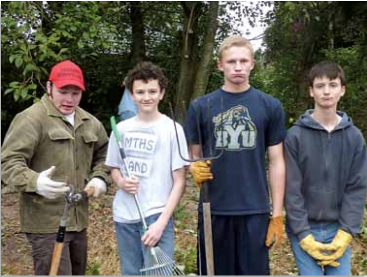
Fall Park Clean Up Volunteers