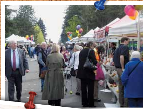
A Farmers Market was started by the Mountlake Terrace Business Association in 2010 as a result of community input heard during the Town Center Plan meetings.