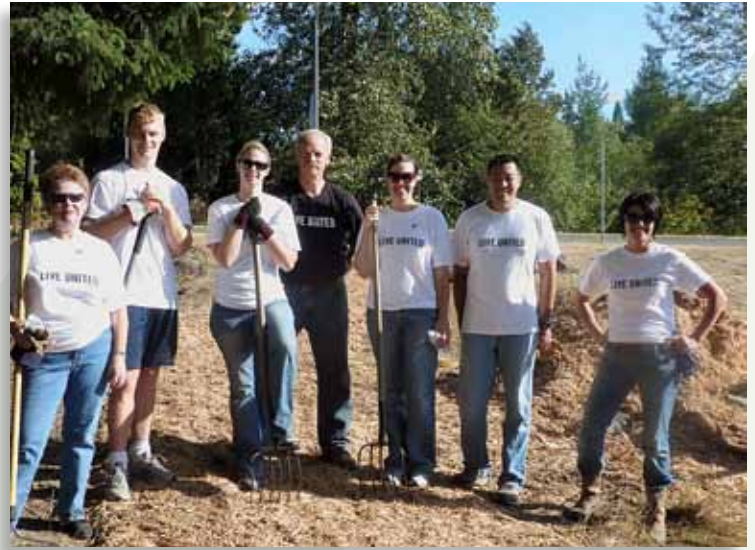
2011 United Way Days of Caring Volunteers