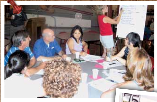
One of the Town Center Plan community outreach meetings held in 2006.