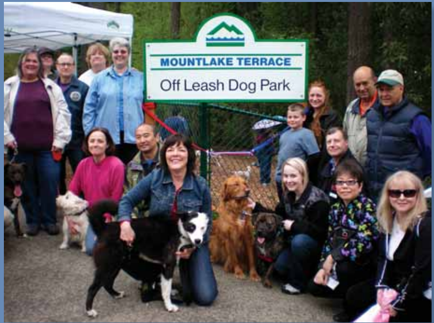
The Off Leash Dog Park had its official ribbon cutting ceremony on Saturday, May 2. Pictured here are members from the Recreation and Parks Advisory Commission, the City Council and MLT D.O.G. (and their four-legged friends). For more information about the dog park, contact the Parks Department at (425) 776-1811 or visit www.cityofmlt.com and/or www.mltdog.org .

For more information about applying for a Comprehensive Plan amendment or to confirm public hearing dates, please call the Community and Economic Development Department at (425) 744-6280.