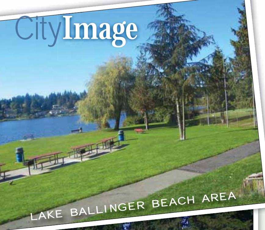
LAKE BALLINGER BEACH AREA